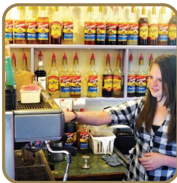
Left to right: Youth employment outcomes happen readily when partnerships lead to job shadow experiences that grow into the needed hard and soft skills.